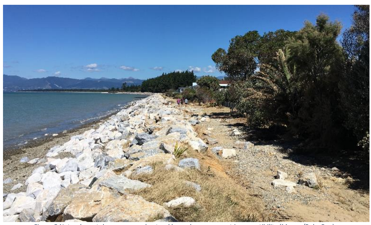
Figure 5 Natural coastal processes and natural hazard management incompatibility (Mapua/Ruby Bay)