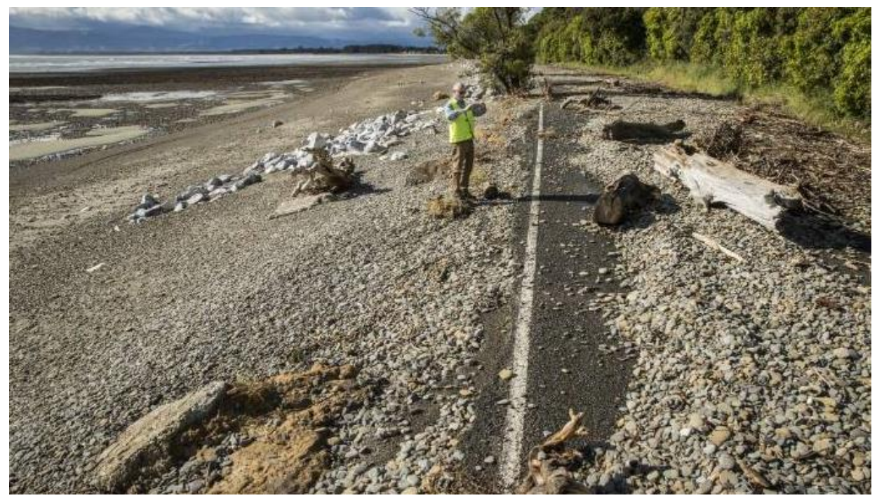
Figure 4 Natural coastal process and infrastructure incompatibility (Ruby Bay)