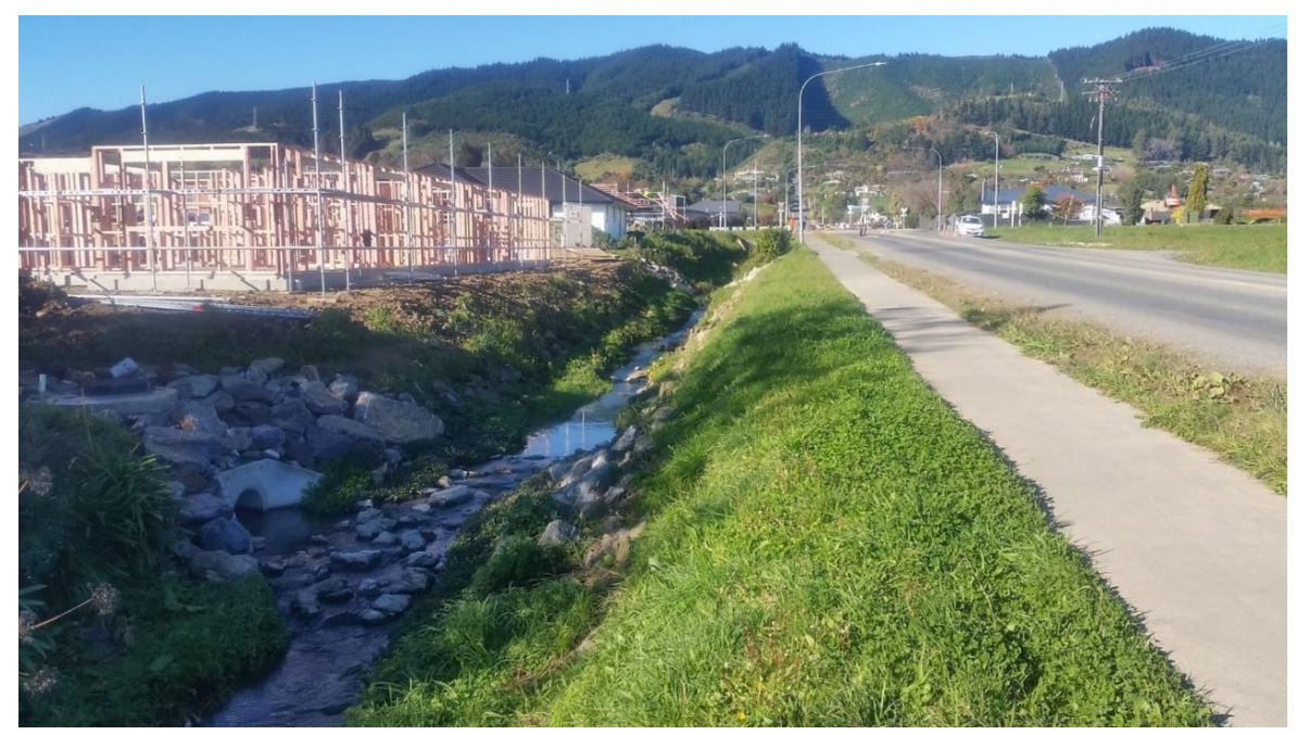
Figure 2: Lack of adequate river setbacks (Bateup Road)-